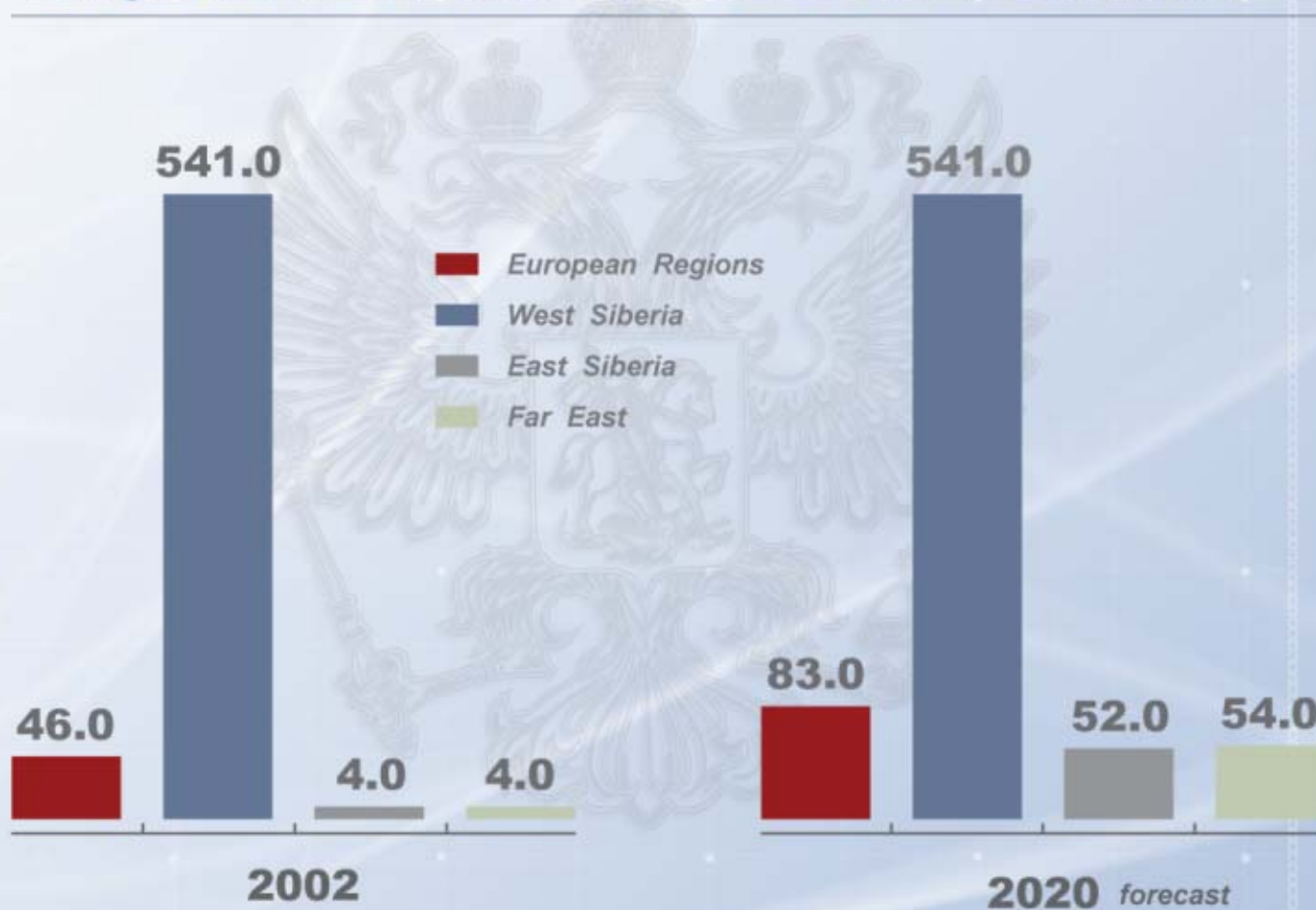
Geographical Distribution of Russia's Gas Production, bcm